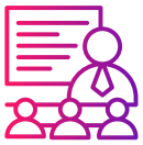
Digitally-led Classroom Training